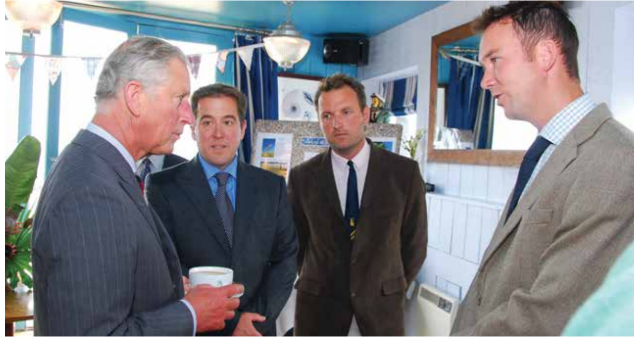
HRH meets members of the Isle of Scilly Farming Initiative Steering Group