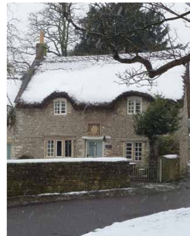
The Thatch, Newton St Loe, Bath

Several members of The Prince's Council also sit as non-executives on one or more of the Duchy sub-committees. The sub-committees currently operating are: Finance & Audit, Executive, Rural, Commercial & Development and Remuneration. It is through this structure that the requirements of The Prince's Council are delivered to the executives and the resulting activities reported back to The Prince's Council.