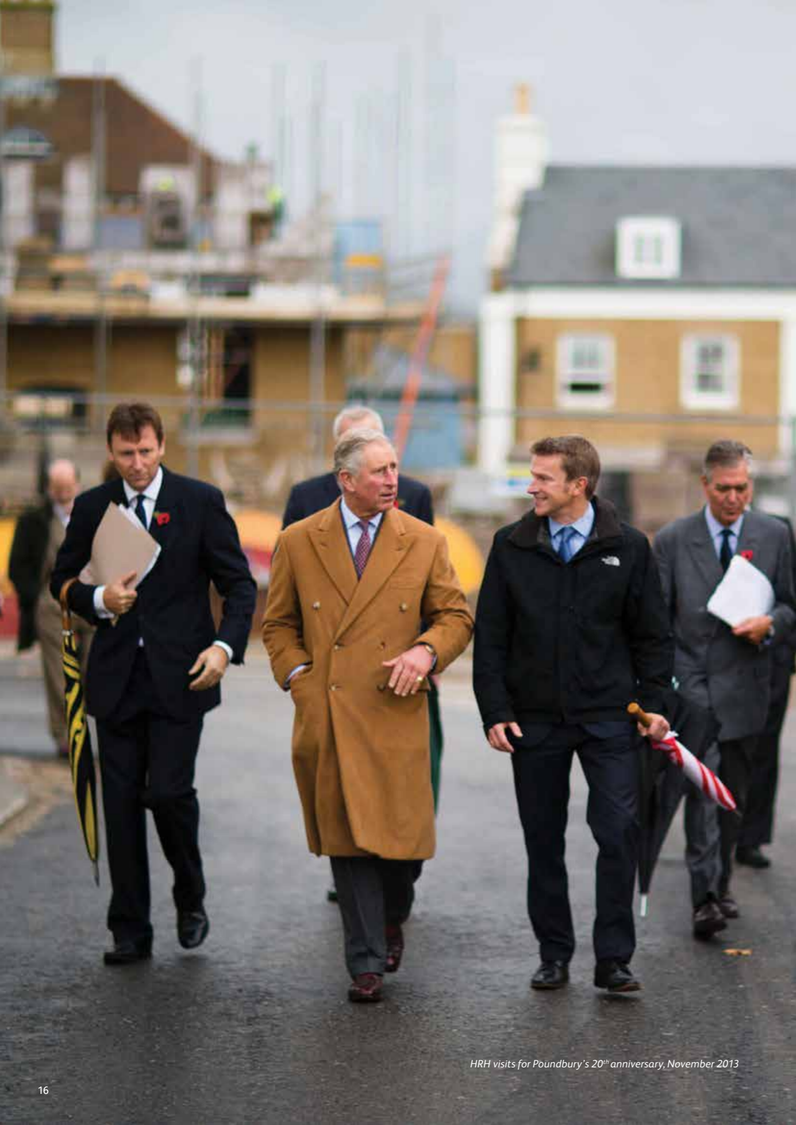
HRH visits for Poundbury's 20 th anniversary, November 2013