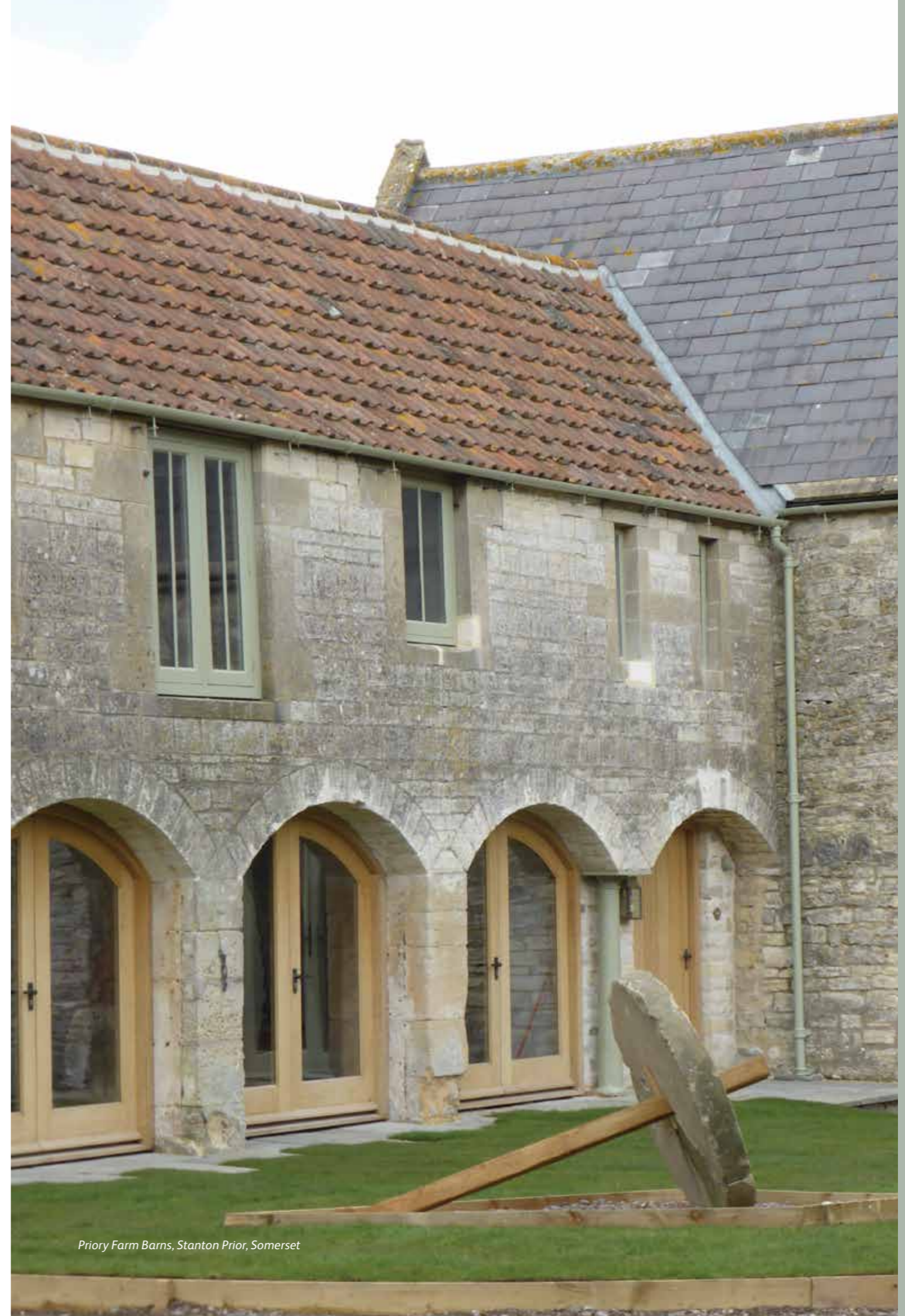
Priory Farm Barns, Stanton Prior, Somerset