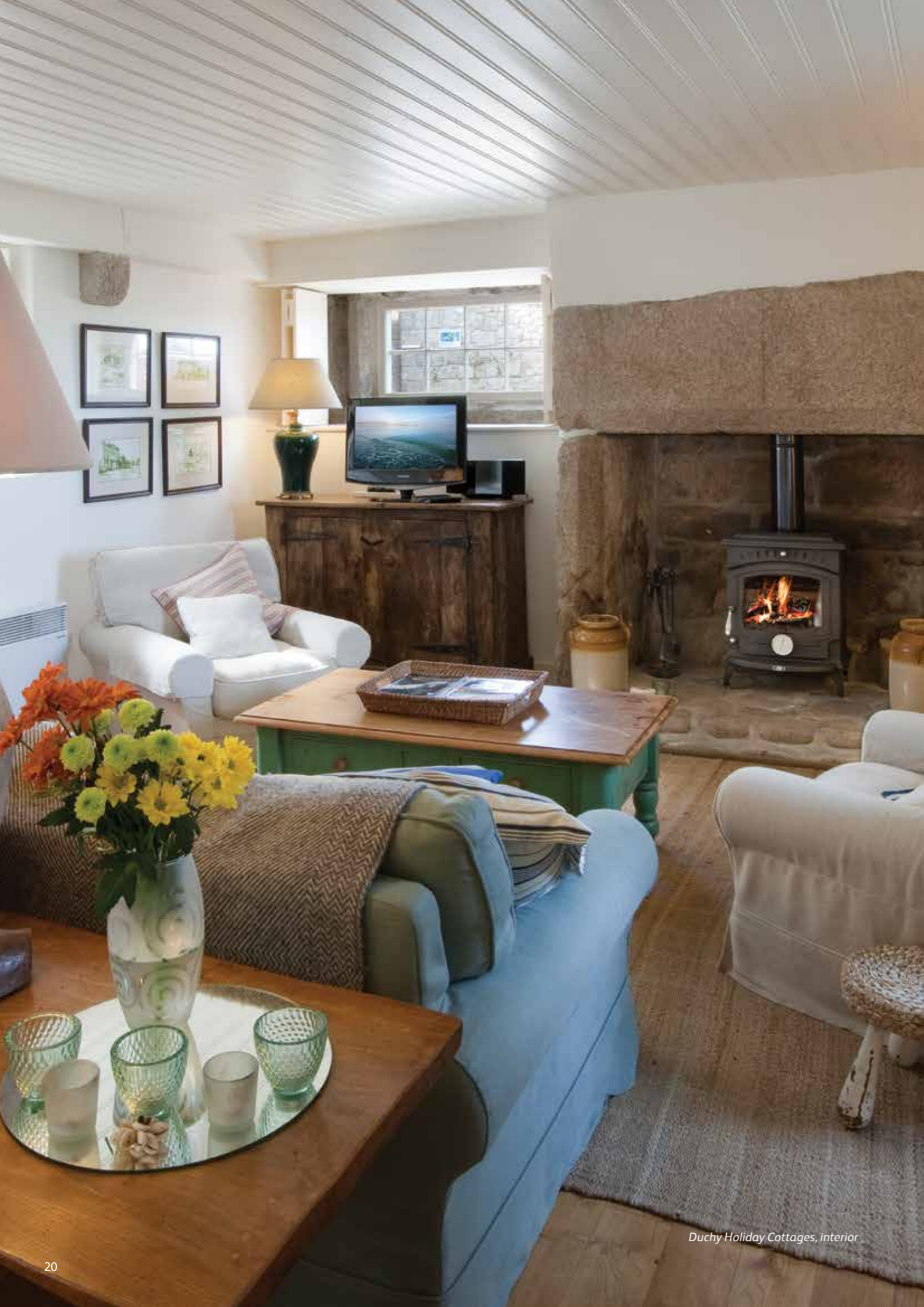
Duchy Holiday Cottages, interior