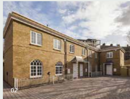
02. New development at Courtenay Street, Kennington, London