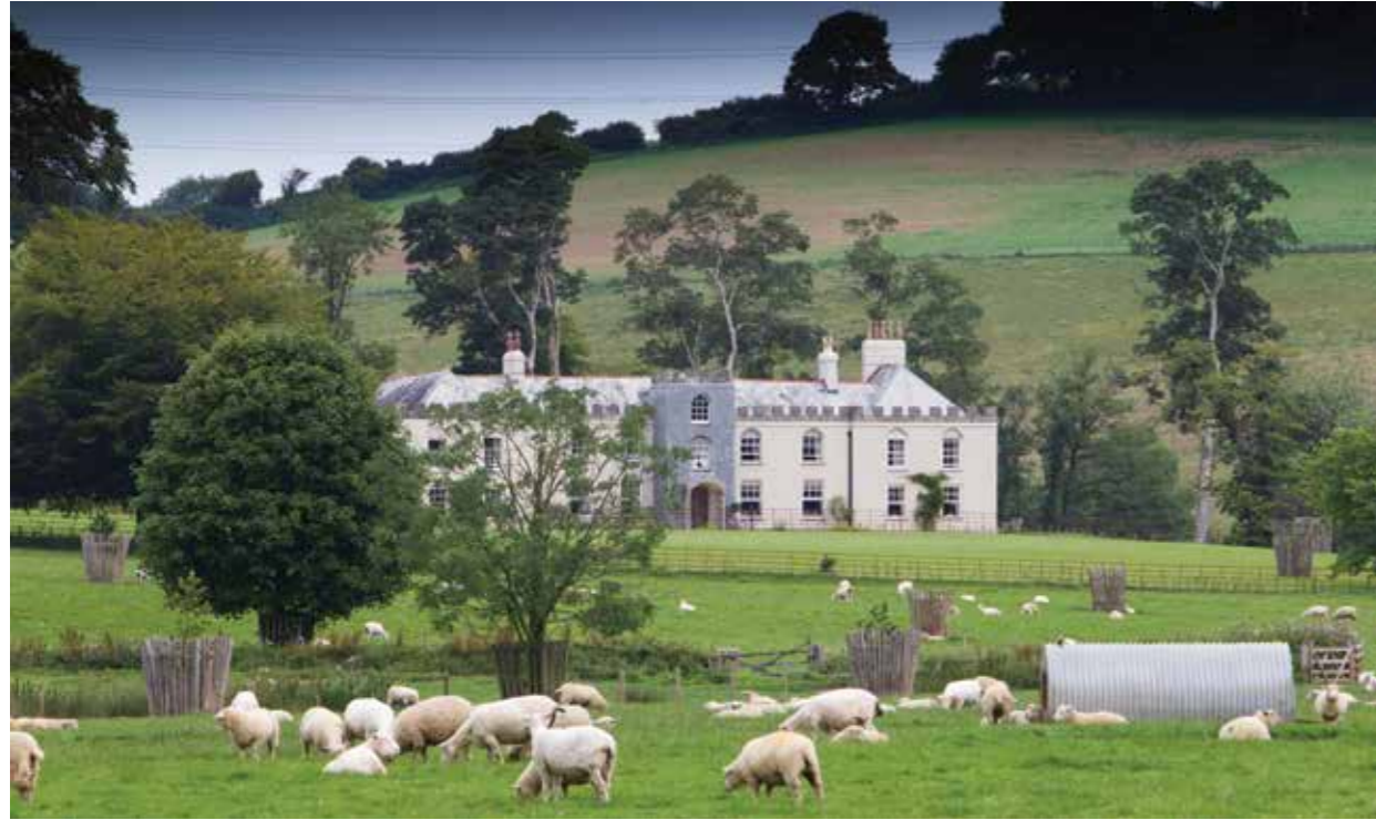
Restormel Manor, Cornwall