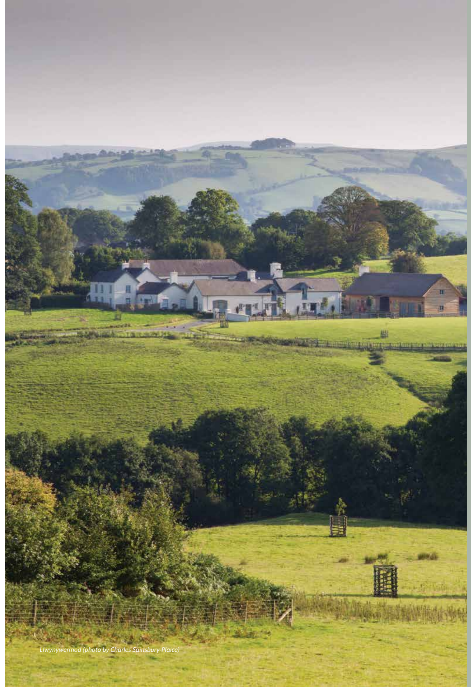
Llwynywermod

After making due enquiries and undertaking the normal forecasting procedures, the Proper Officers consider that the Duchy has adequate resources to continue in operational existence for the foreseeable future. Accordingly, they have continued to adopt the going concern basis in preparing the Financial Statements.