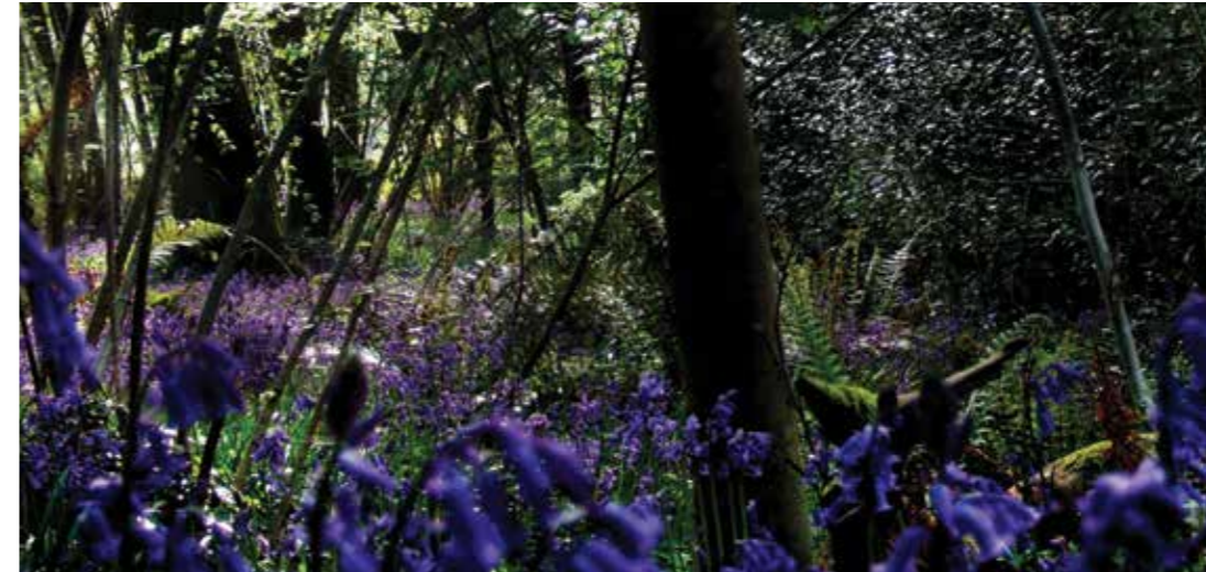
Bluebells in Cornwall