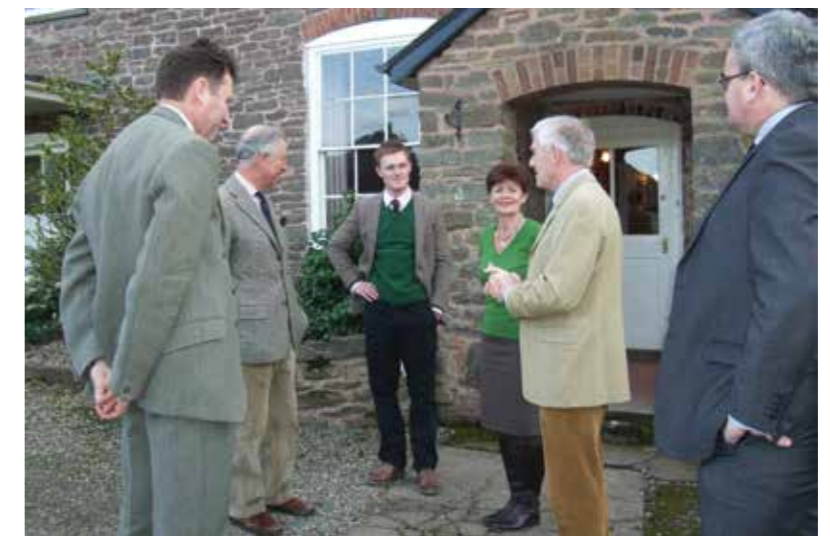
HRH with the Price family, Dewsall Court Farm, Herefordshire

Due to the success of the first day, a second day was held on the 12 th February 2014, Soil Degradation by Erosion: Risk Assessment and Mitigation Options. The morning consisted of a series of lectures from soil experts. The afternoon was spent at Cobrey Farm, a local arable farm, looking at erosion mitigation measures developed in asparagus fields. Cranfield have been working closely with Cobrey Farm in order to manage extreme soil erosion issues and as a result have designed and installed a series of geotextile grass waterways. As a result of this relationship, the Duchy is in the process of installing a similar grass waterway on land prone to flooding on the Harewood End estate in order to minimise surface run-off and soil erosion.