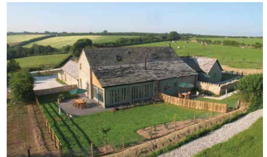
Duchy Holiday Cottages, Loskeyle, Cornwall

The Prince's Countryside Fund, founded by HRH The Prince of Wales, was set up by Business in the Community in July 2010. So far it has given over £3.8 million in grants distributed to over 90 projects across the country, directly benefitting 64,000 people. In addition to its normal application process, the Fund also operates an emergency fund for times of need. All the projects focus on supporting the people who care for our countryside and make it tick.