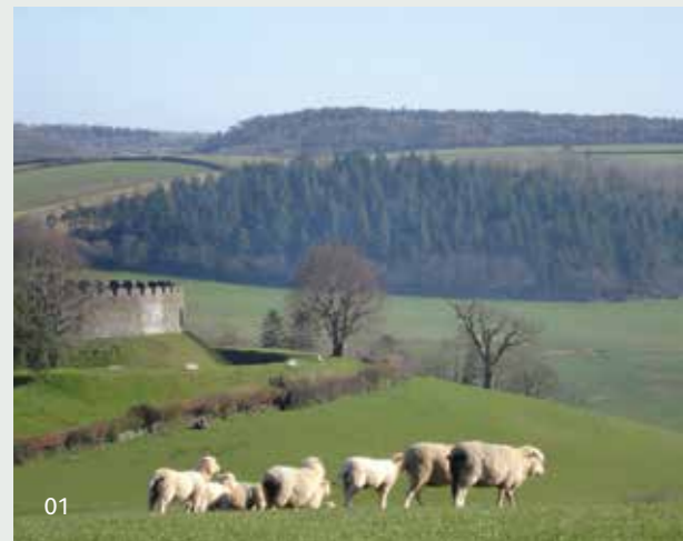
01. Restormel Castle, Cornwall

The Group capital account increased by £72.9million arising predominantly from significant rises in agricultural holding values, which rose by 16%. Commercial and residential holdings also increased in value although this gain was marginally offset by a decline in financial asset values.