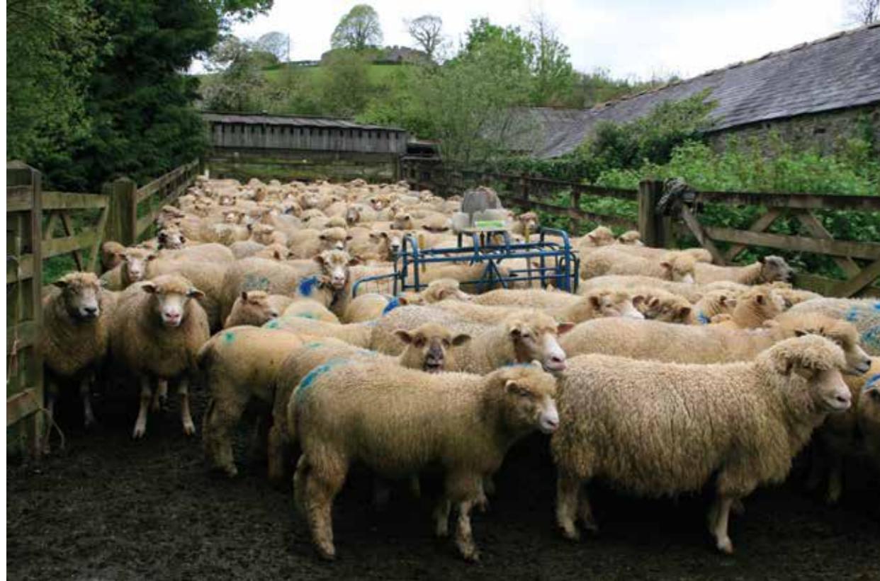
Lambs being weighed, with Restormel Castle in the background