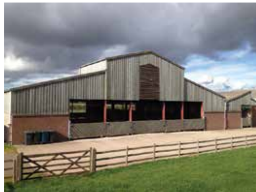
Sycamore Farm outbuildings

The Duchy of Cornwall’s strategy of facilitating a number of starter farms embodies His Royal Highness’s belief that it is essential to create suitable opportunities for new entrants to gain a foothold on the farming ladder thus bringing new life into farming communities.