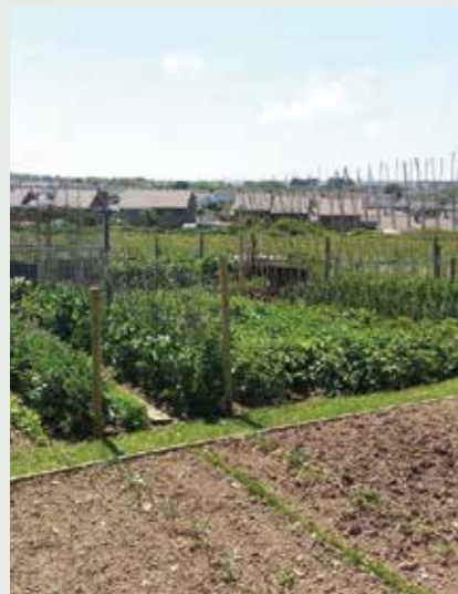
New allotments, Nansledan